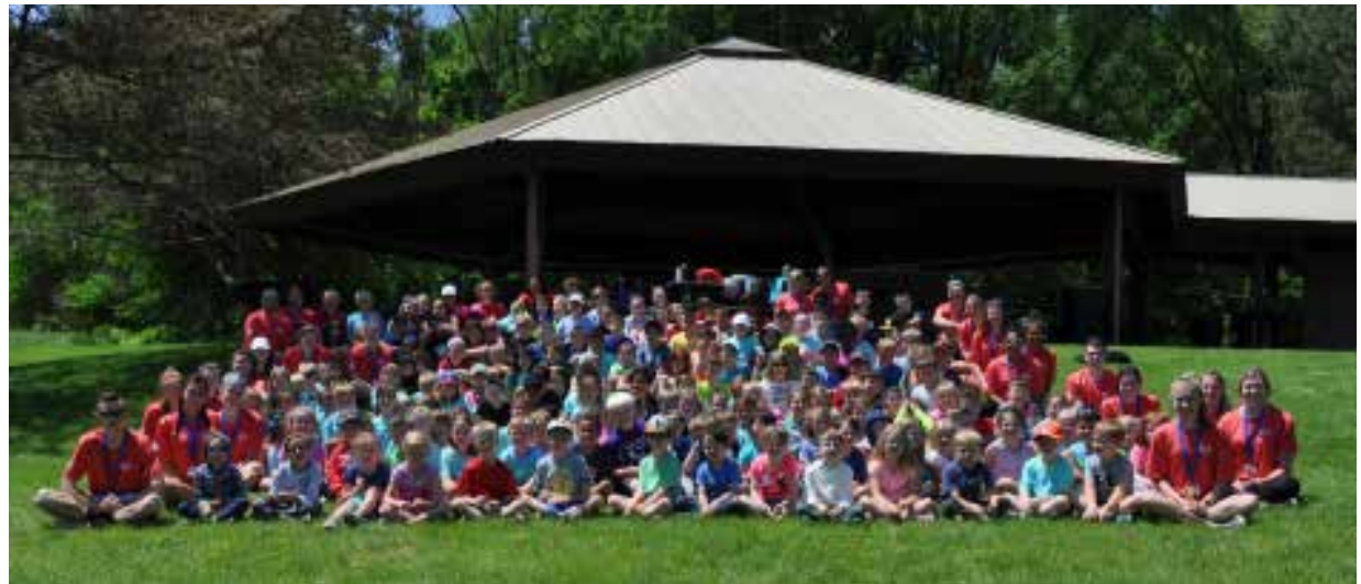
Photo taken summer 2019